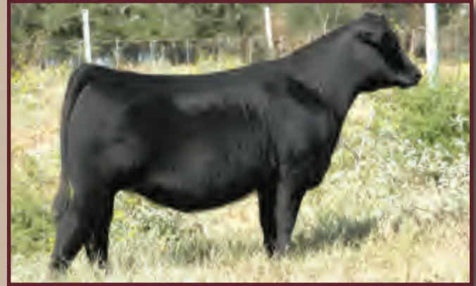
Lot 21A - Ms S Rock Elira 639X3