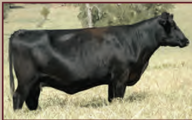
Lot 51 - Ms Krause Jauer 747 5079S

Broody, big ribbed Jauer 747 daughter. Safe to the low BW, balanced trait AI sire, Final Answer.