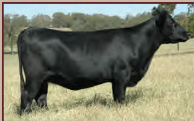
Lot 38 - Ms S Rock Ideal 2243U