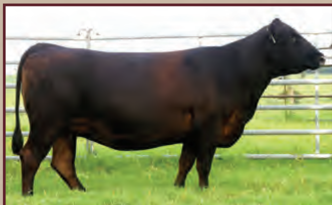
Lot 43 - Ms S Rock New Horizon 3032R