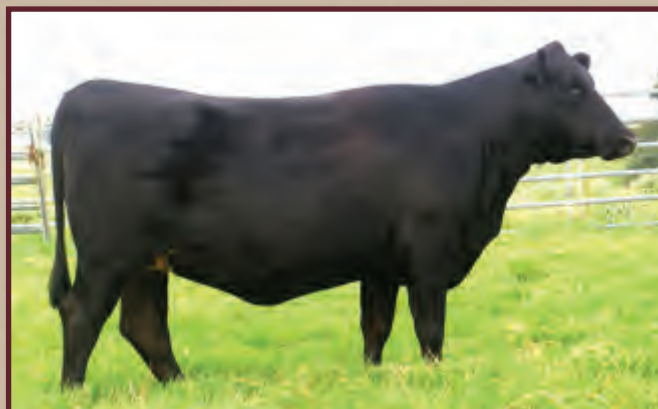
Lot 13 - Ms S Rock Highlight 228U2

Easy fleshing Emblazon X Freightliner daughter.