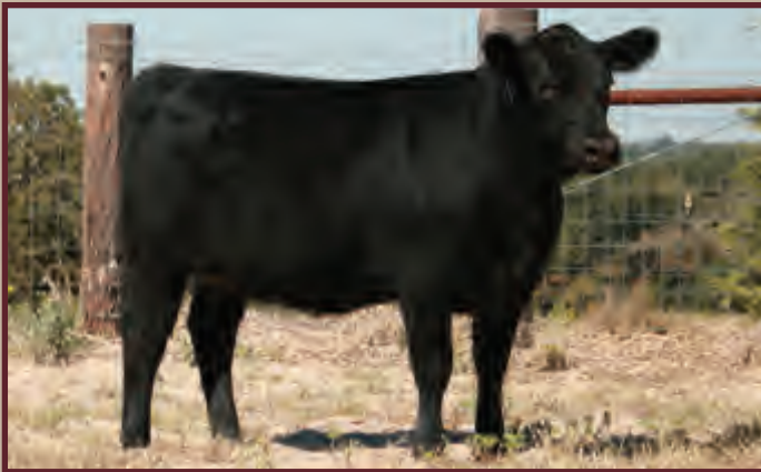
Daughter of Lot 2 - Sired by B C Maverick 2702 ET