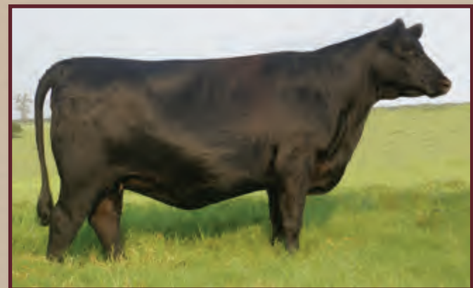
Ms S Rock Sunset Pride 5028U - a maternal sister to lot 71

Bigger framed, nice profiling In Focus son out of a very moderate Jauer 747 X VRD female back to the foundation Drake Farms bred Big E daughter. Dam is really moderate but produces a lot of performance with a powerful phenotype. Check out his maternal sister 5028U being offered as part of the the flush lot 4. Calving ease with added growth, big SC and good carcass EPD's.