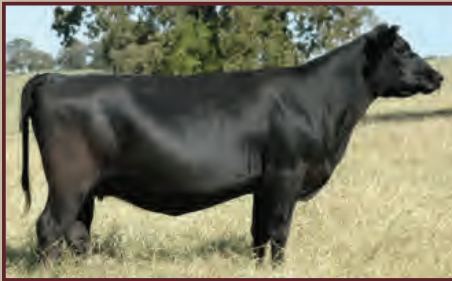
Lot 33 - Ms S Rock New Day 846S3

Slick haired New Day daughter from the OCC Blackbird family. Balanced performance female who ratioed 113 WW, 109 YW and 107 REA. Her son, 846W, who had a low BW ratio of 91 with a 104 WW ratio sells as lot 64. Her spring heifer calf by Thunder combines the outstanding phenotype expected with a birth to weaning spread of 91 BW ratio and 103 WW ratio.