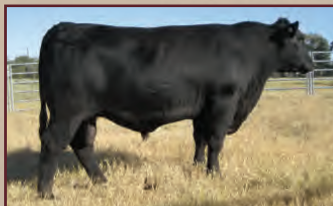
Lot 67 - S Rock Final Answer 4545W

Low BW, good growth with added carcass merit and scrotal circumference in a slicker haired Final Answer son out of a consistently top producing 1407 X Prime Time female. Herd sire candidate especially if you need to add some carcass quality while maintaining performance and fertility and reducing birth weight.