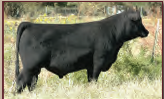
Lot 16A - S Rock Danny Boy 308X2

High performing Danny Boy X Jauer 747 X 208 X Emblazon bull calf ratioed 108 at weaning.