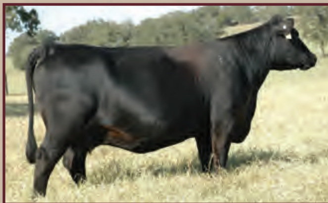
Sedgwicks Lucy 4876 - Dam of lot 70

Really attractive and stouter made In Focus son out of a bigger framed 1483 daughter that was 12 at the time he was born. The 4876's are super sound, having great feet and legs. This is one of the nicest designed In Focus sons I've seen. Check out the In Focus yearling heifers selling from this family as lots 47B and 48B. Ratioed 106 WW, 102 YW and 105 IMF.