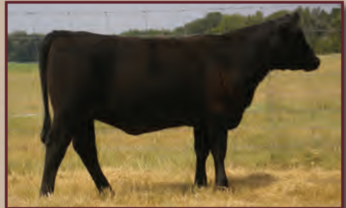
Lot 15B - Ms S Rock Witch 308W2

Flashy, high performing Danny Boy daughter who ratioed 110 for WW. Updated EPD's after yearling measurements will be on the sale supplement.