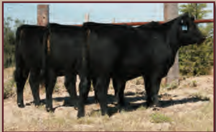
Daughters of Lot 2 - Sired by B C Maverick 2702 ET