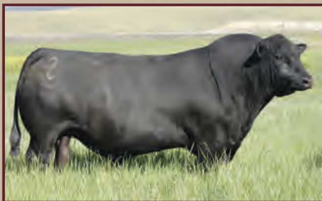
Reference Sire - Sitz Rainmaker 9723

Stout, slicker haired Jauer 747 son out of a bigger framed 5175 daughter of the foundation 335 donor. Ratioed 95 BW, 100 WW, 101 YW, 109 REA and 95 IMF. Good growth, Milk, SC and carcass EPD's. Flush of dam offered as part of choice flush lot 3.