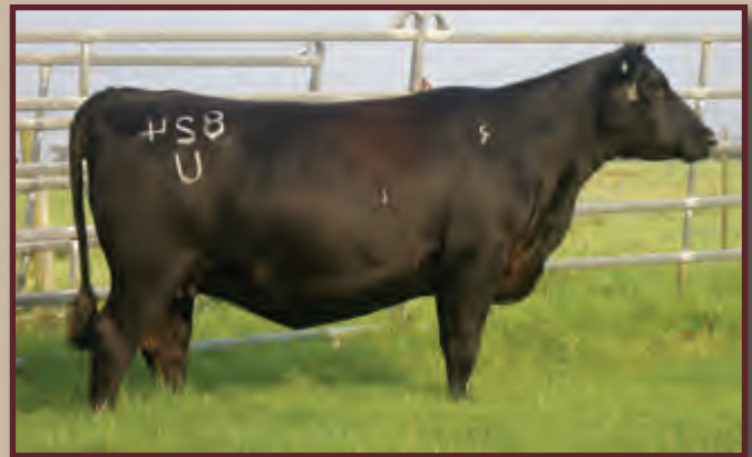
Lot 28 - Ms S Rock Dixie Erica 824U

Selling choice in three members of the Dixie Erica family. 824S3 is a 004 daughter of the foundation Dixie Erica in the Solid Rock program, 824B. O C C Dixie Erica 824B is a three-quarter sister to 6807 (23-4 X F0203) from the Rollin' Rock Dixie Erica family. She weaned her last calf at age 17. 824S3's calving ease Thunder bull calf selling should be a herd sire for someone. Her first calf is the beautiful Mainline daughter also included in this choice lot.