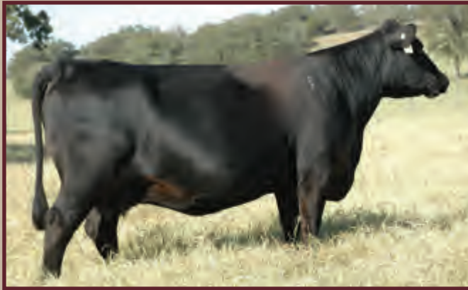
Sedgwicks Lucy 4876 - Granddam of lot 47