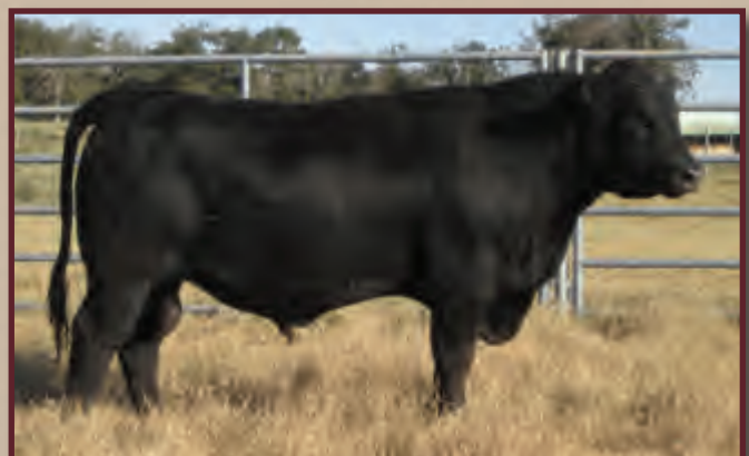
Lot 62 - S Rock Final Answer 639W3

Stout, big ribbed, big hipped Final Answer son back to the 044 daughter that is the foundation for the Elira 639 family in the Solid Rock herd. His dam was wedged into a hay stack in a storm and died when he was one month old. He stole enough milk to survive and really performed. He ratioed 99 at birth and would have ratioed well over 100 for WW, YW, REA and IMF. Compared to that set of bulls, he had the 2nd highest WW and SC, 3rd highest YW and REA and far and away the highest IMF (would have ratioed 146). Definite herd sire candidate.