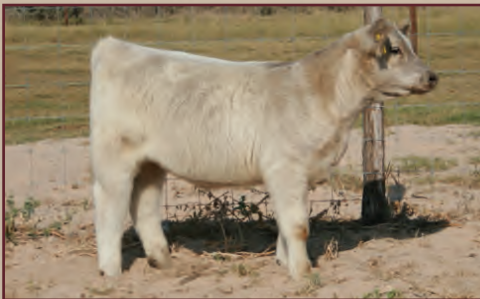
Lot 9 - Charolais X Maine Composite Heifer