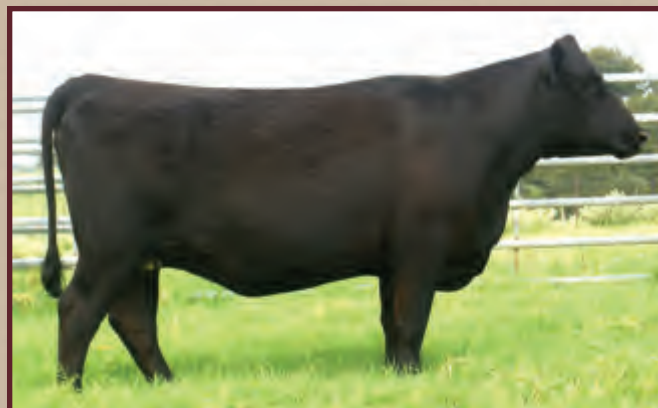
Lot 36 - Ms Krause Magic Lass 1387U

Attractive In Focus daughter has a balanced EPD profile. In Focus X Jauer 747 has been a good cross.