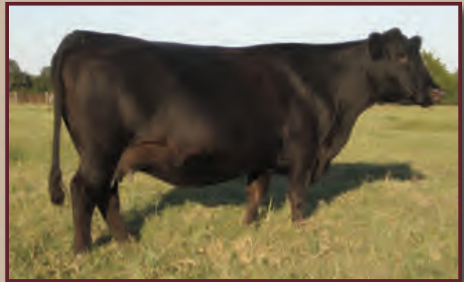
Ms S Rock Newline 335R4 - Full Sister to dam of lot 60

Lower birth weight Jauer 747 son out of a calving ease and very feminine Dedication X Sleep Easy cow.