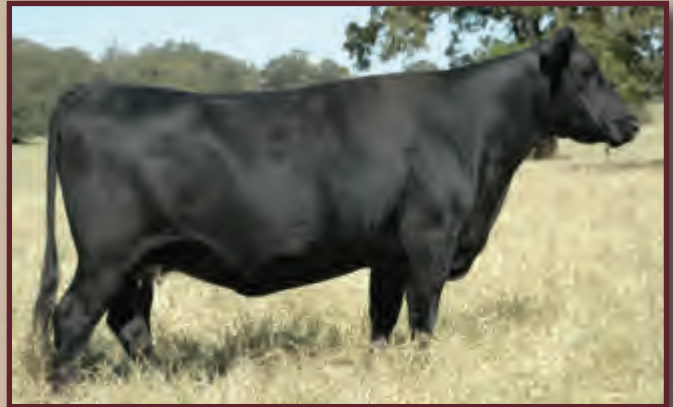
Lot 53 - Ms S Rock N Dsgn 878 6001S2

Combines the low BW, high growth, big scrotaled ABS sire, CAR Efficient, with an Index daughter out of the foundation Barbaramere 6001 in the Solid Rock program. These 6001's really outproduce themselves and this broody young female should make a productive cow. The Thunder mating on these 6001's should be a good combination and leave a set of useful bulls and productive and attractive females.