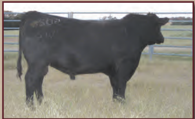
Lot 71 - S Rock In Focus 5028W2

Hays son out of the Contrast daughter of Ms S Rock N Dsgn 1407 4545P. Dam sells as lot 45.