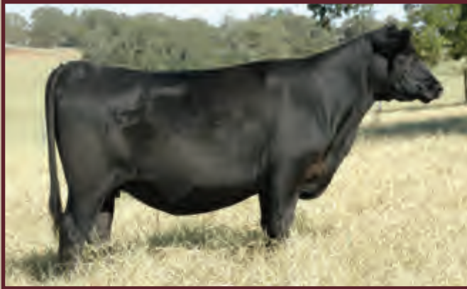
Lot 21 - Ms S Rock Elira 639U3