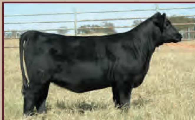
Lot 17A - Ms S Rock Witch 308X