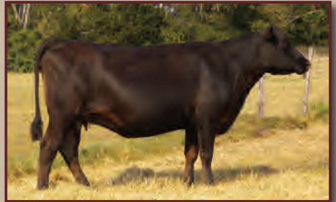
Lot 11 - Ms S Rock Trav 004 118S