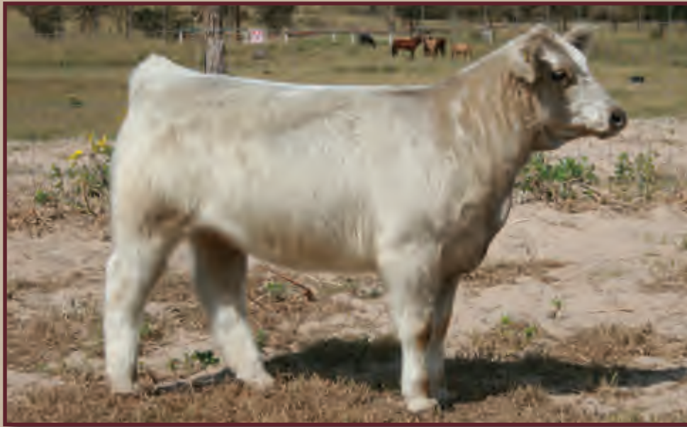
Lot 8 - Charolais X Maine Composite Heifer