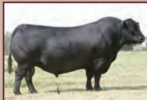
Reference Sire - SA V Final Answer 0035

The last of three full sisters with similar phenotype and maternal potential. Due in January to Final Answer, her calf will be a full sib in blood to the 2243X spring heifer calf selling in the previous lot.