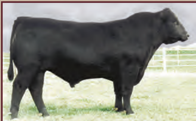
Reference Sire - Connealy Danny Boy