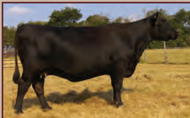
Lot 14 - Ms S Rock N Design 208 308R

Moderate, big ribbed 208 daughter out of a beautiful Emblazon female being offered as part of the choice flush lot 4. Granddam was a very feminine and angular New Trend X Power Play X Shearbrook Shoshone donor for Partisover and Austin Land & Cattle and then for Solid Rock.