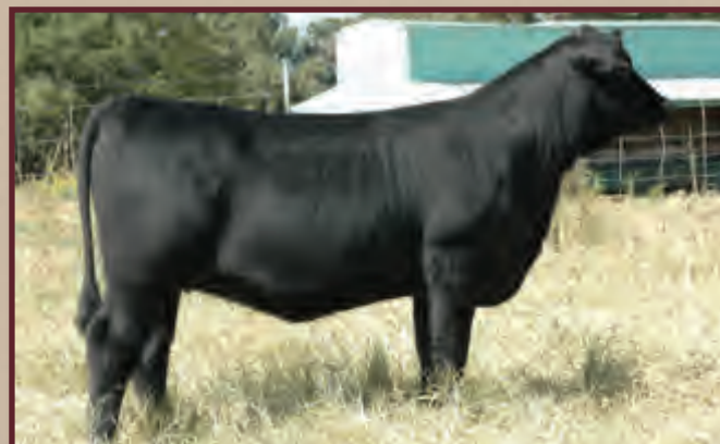
Lot 33A - Maternal Sister to lot 64

Another stout Hays son out of a good producing New Day female that sells as lot 33. Check out is phenomenal maternal sister selling as lot 33A. Slicker haired bull with good carcass EPD's should produce a functional set of good milking replacements.