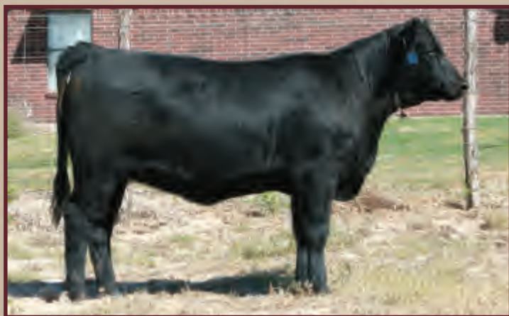
Daughter of Lot 1 sired by N Bar Emulation EXT