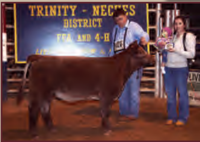
Jakes Proud Jazz Heifer out of 517N Champion Shorthorn and Reserve Overall