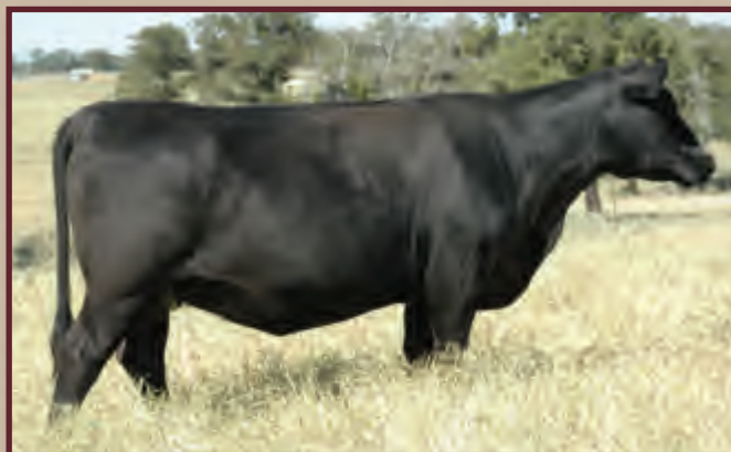
Lot 17 - Ms S Rock Jauer 747 308S6