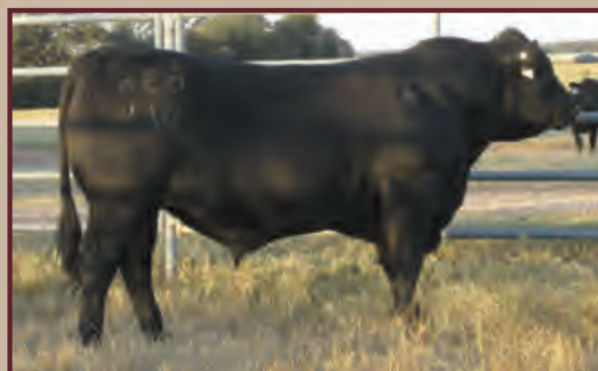
Lot 63 - S Rock Efficient 639W4