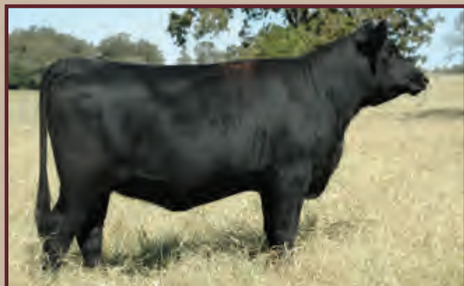
Lot 37 - Ms Krause Magic Lass 1387W

Very similar to her full sister, 1387U, who is selling as the previous lot.