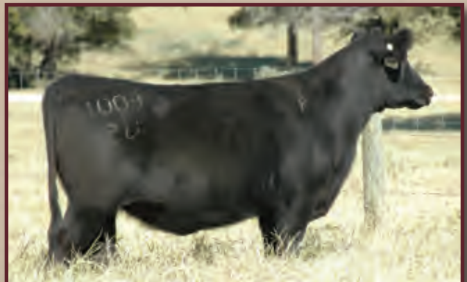
Lot 56 - Ms S Rock Barbaramere 6001U5

Misbranded the year letter on this spring 2009 born bred heifer by Retail Product. Safe to the balanced trait, superior phenotype sire, Connealy Thunder. Check out the Thunder heifers selling, they are impressive.