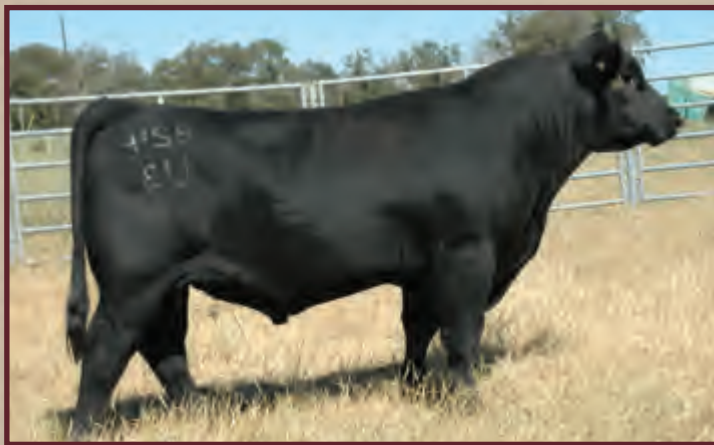
824U3 - Reference Sire