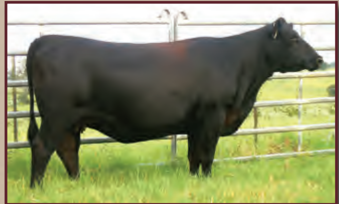
Lot 39 - Ms S Rock Trav 004 2243T

LOT 39A: Bull calf born 9/18/10 by Cooley Fnl Answer. BW: 58lbs Tattoo: 0078