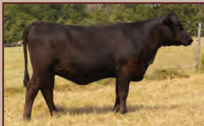
Lot 25B - Ms S Rock Bonnie 769W

Productive member of the Bonnie family. She did an exceptional job on her first calf, a Final Answer daughter who ratioed 102 for BW and 112 for WW. Her calf at side, also by Final Answer, might be even better.