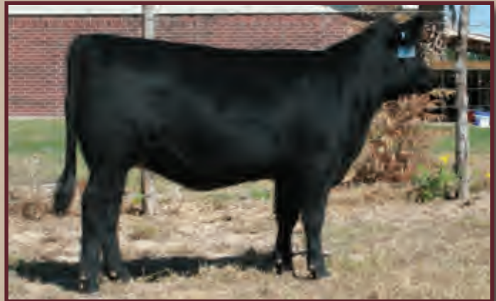
Daughter of Lot 2 - Sired by B C Maverick 2702 ET