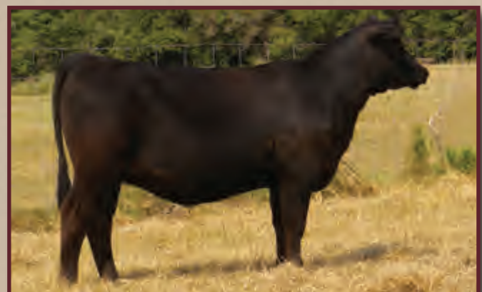
Lot 34B - Ms S Rock RR Blackbird 846W7