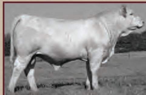
Cooley Hawken 116P9 ET Sold for $9,000 Hoodoo Crook 7118 x Hoodoo Ms George Z0116 Maternal Brother to Flush Cows