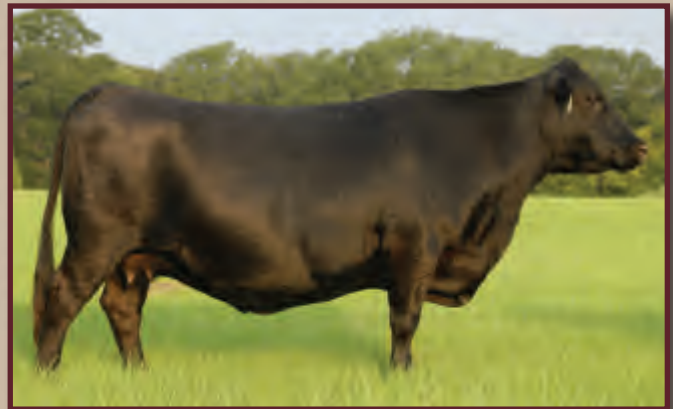
Deer Creek Ext 335 - Granddam of lot 60 & 61

Attractive, balanced trait CAR Efficient son out of a very nice Danny Boy daughter of the foundation female, Deer Creek EXT 335. 335W5 would be a good choice to use on heifers, especially if you want to produce a nice set of moderate framed and functional replacement females out of them.