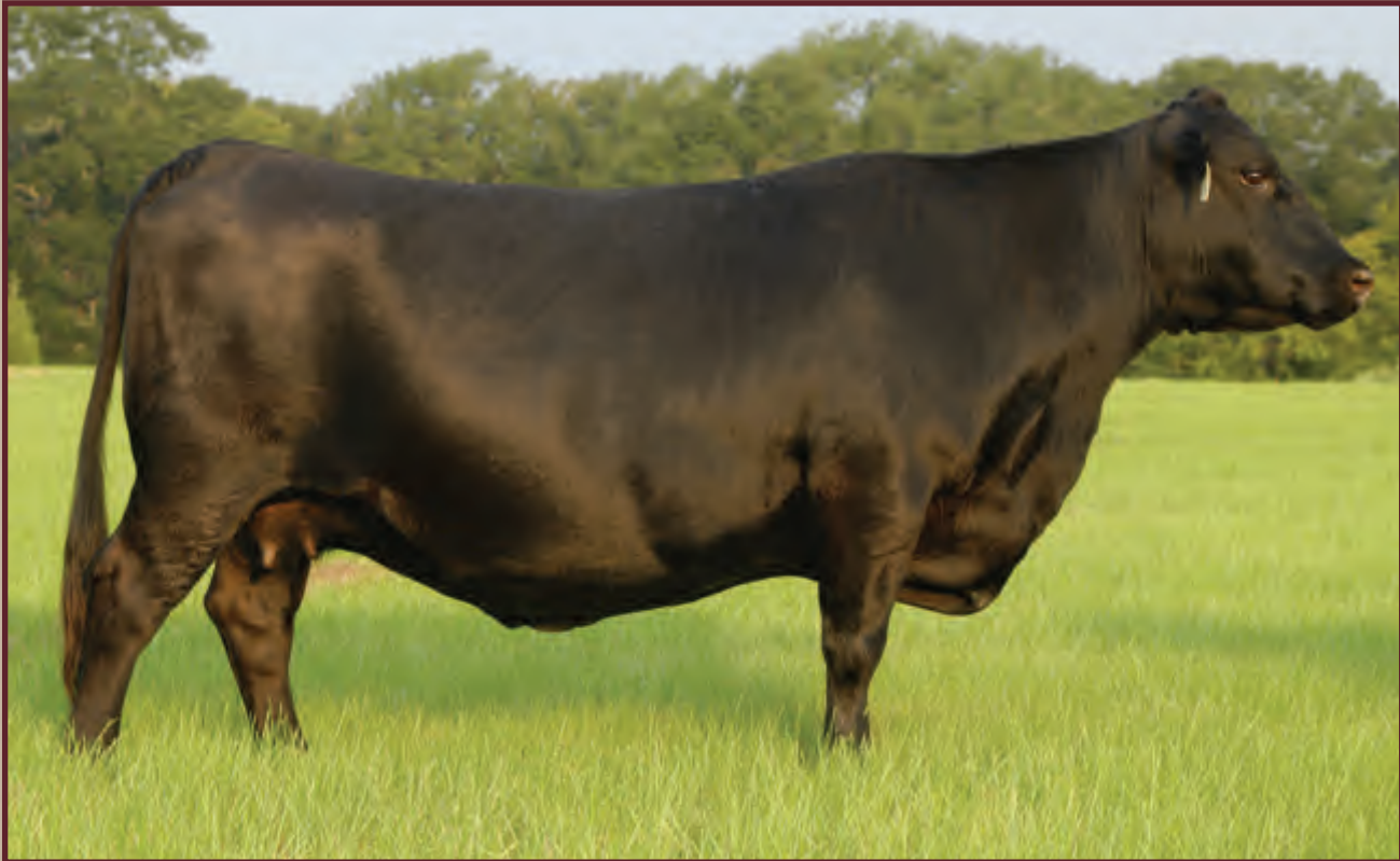
Lot 3 - Deer Creek Ext 335

Choice of Flush on Lot 3 or one of Her Descendents