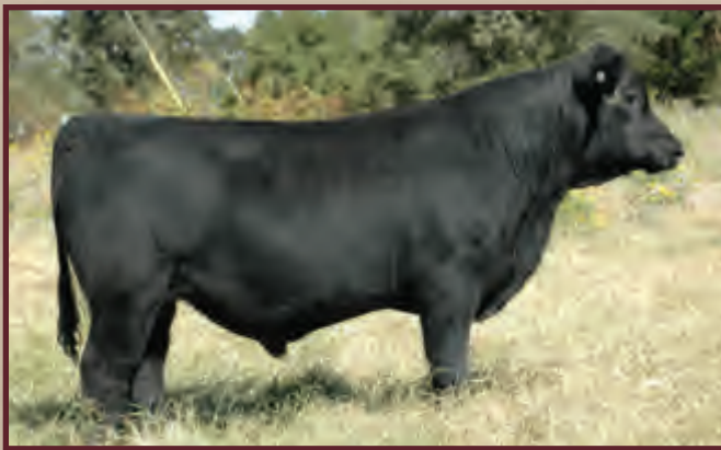
Lot 27A - S Rock Thunder 824X

Selling choice in these three Dixie Erica's. 824S4's son, S Rock Walker 824U3, has been retained and used as a herd sire in the Solid Rock program. He exhibits the soundness, rib shape and depth, attractive front and hip typical of the Dixie Erica's. I am really excited to see his first calves. 824S4 is a moderate, complete and attractive female who is the right kind to build a program around.