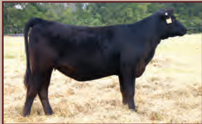
Lot 11B - Ms S Rock Georgina 118W

High performing 004 X VRD daughter who ratioed 98 BW, 101 WW, 116 YW and 123 REA. Powerful and attractive Chisum heifer calf at side. These Chisum calves are impressive.