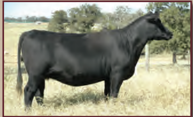
Lot 27 - Ms S Rock Trav 004 824S3