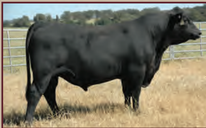
Lot 75 - S Rock Rainmaker 4876U6

Moderate framed, big ribbed, easy keeping Rainmaker 9723 son out of a nice Freightliner female. Dam is part of the choice flush lot 4 and a maternal sister sells as lot 48. Solid set of EPD's with a 119 IMF ratio.