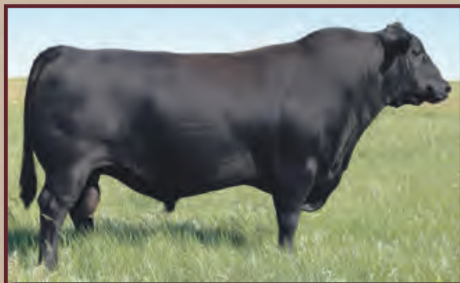
Reference Sire Bennett Total