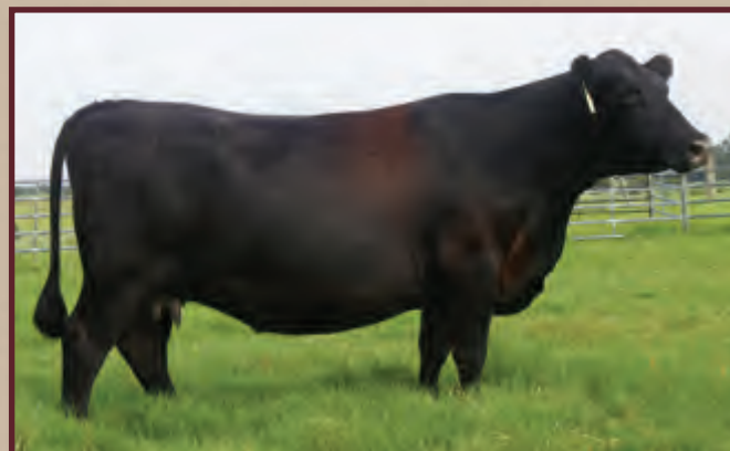
Lot 44 - Ms S Rock Frontier 3114R2