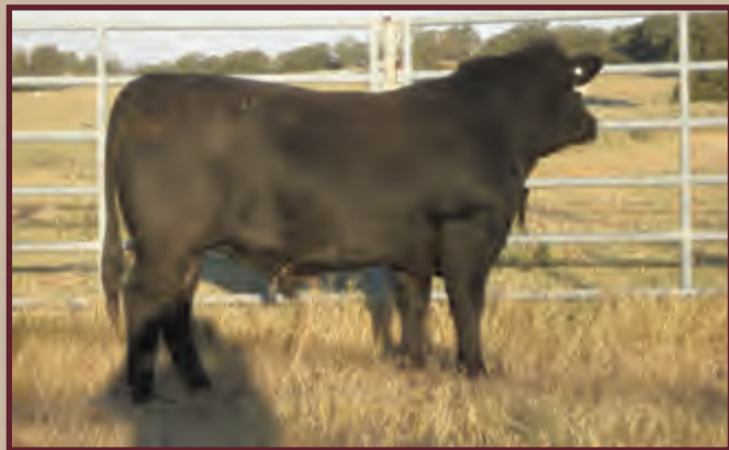
Lot 70 - S Rock In Focus 4876W2

Hays X Index back to the Prime Time 4545J female from RA Brown.