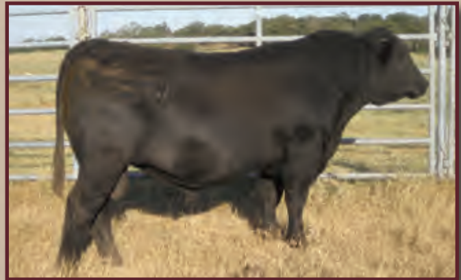
Lot 60 - S Rock Hays 335W3

Powerful Hays son out of a good producing young Newline daughter of the Solid Rock foundation female Deer Creek EXT 335. The females from the Queen 335 cow family are really complete, sound, functional and slick haired. 335W3 should produce a tremendous set of daughters and a rugged set of sons. He ratioed 107 WW, 108 YW and 117 REA.