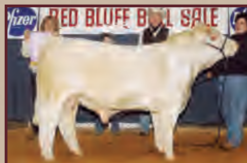
Cooley Crk7118 116P2 "George" Red Bluff 2006 Champion Charolais sold for $7,200 Hoodoo Crook 7118 x Hoodoo Ms George Z0116 Maternal Brother to Flush Cows