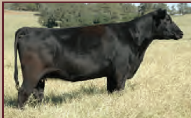
Lot 58 - Ms S Rock Right Way 6034S3