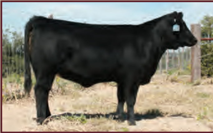
Daughter of Lot 2 - Sired by B C Maverick 2702 ET