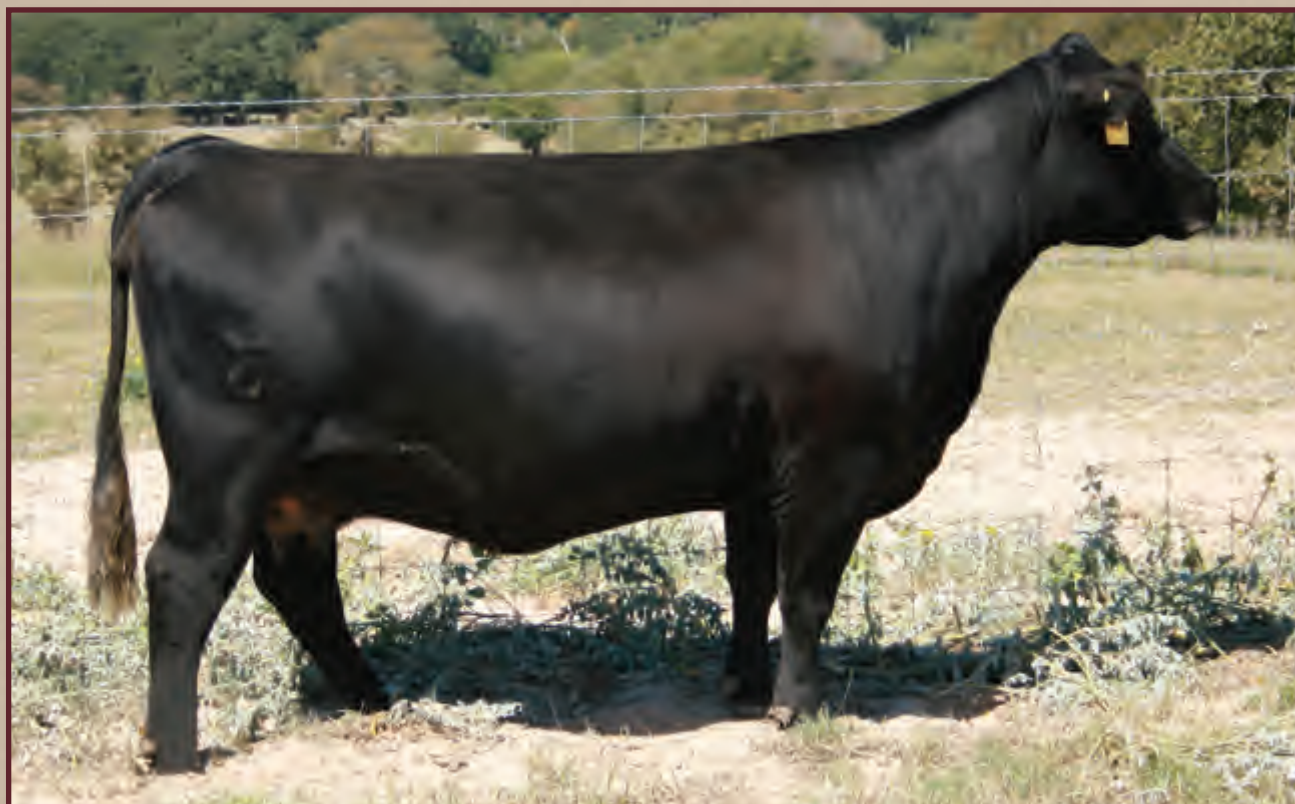
Lot 1 - B3R 8093 270 Erica 3179 (pictured 9/2010, at 12 years of age, just off pasture nursing a calf)