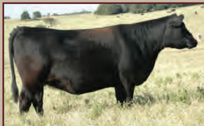
Lot 20 - Ms S Rock Contrast 413T

Feminine, beautiful uddered Right Way daughter. Her last calf ratioed 90 for BW and 102 for WW. Dam is a full sister to the dam of lot 17. Low BW Clarity heifer calf at side. Son sells as lot 72.