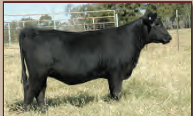
Lot 41A - Ms S Rock Ideal 2243X

Full sister to the previous lot, 2243R2. These females are functional, attractive and productive. Outstanding individual performance, she ratioed 116 for WW, 112 YW, 103 REA and 101 IMF. Had a nice Final Answer heifer which also sells and has been AI'd back the same way.