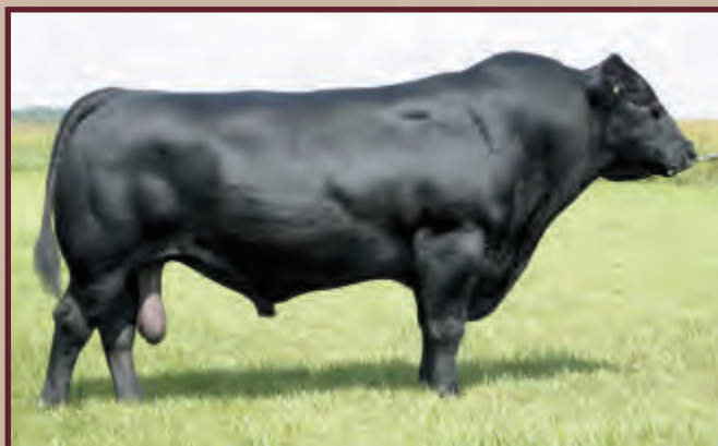
Reference Sire - Woodhill Foresight

Bigger framed, high performing Woodhill Foresight X Pfred son back to the foundation Drake Farms bred Big E daughter, D F Sunset Pride 5028. Ratioed 108 WW, 106 YW, 107 REA and 112 IMF. Powerful set of EPD's across the board with added carcass merit and SC.