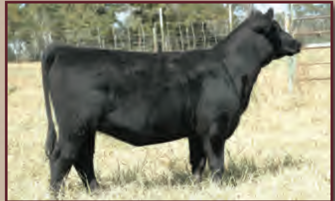
Lot 22A - Ms S Rock Elira 639X4

One of the best heifer calves to sell this fall. Descending from the productive Elira 639 family which adds a lot of shape and capacity. Ratioed 118 for WW in a really attractive package.