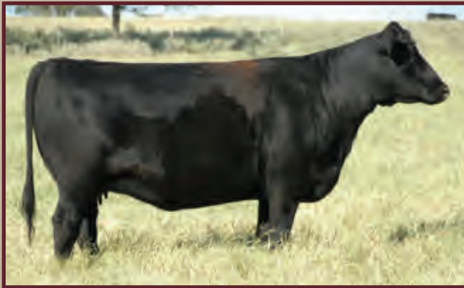
Lot 26 - Ms S Rock Trav 004 824S4