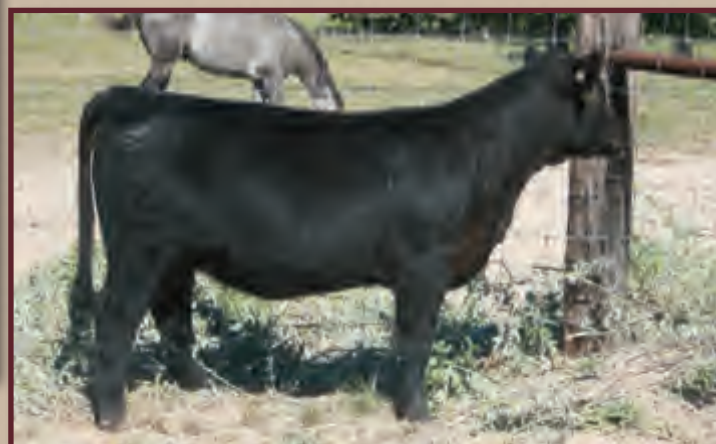
Daughter of Lot 1 sired by N Bar Emulation EXT