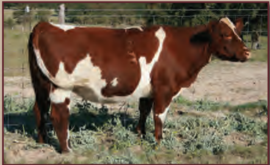
Lot 7 - 517R