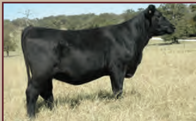
Lot 50 - Ms S Rock S Lucy 4876W

Maternal sister to the previous lot by Preference. This slick haired bred heifer is really flashy. Safe to Bandwagon, the Shaw Cattle Co. herd sire, whose sons have consistently been their top selling sire group going to commercial customers in big range country. Bandwagon is a Right Time son out of a phenomenal Sitz Value daughter.