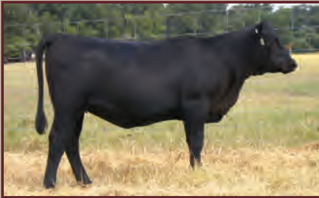
Lot 10 - Ms S Rock Lassie 106W