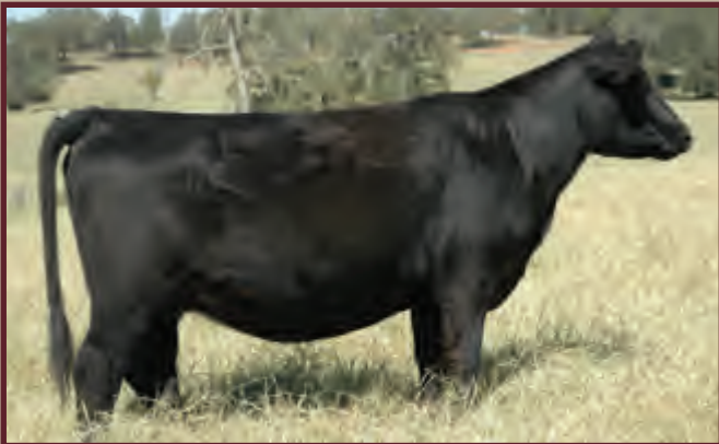
Lot 22 - Ms S Rock Elira 639U

Really complete Bextor daughter out of the picture perfect Dedication X 044 female, 639N. The Elira 639's descend from a big hipped, massive bodied, cool fronted 044 daughter from the RA Brown program. 639U3 ratioed 109 for YW and 120 for REA. Her first heifer calf by Thunder is phenomenal.