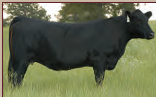
Dam of Lot 46 - Ms S Rock VRD 4876L

Retail Product heifer should make a productive and functional cow adapted to our environment with slicker hair coat, added fertility and genetic balance.