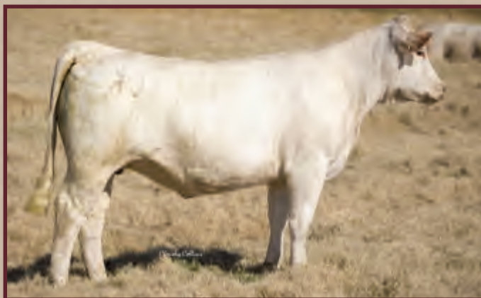
Cream of the Crop Lot 36-Blanco X Z6017 $9,000