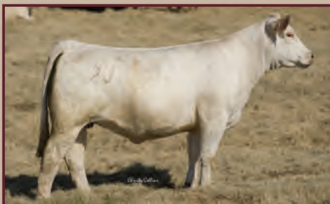
Cream of the Crop Lot 15-Blanco X Z6017 $20,000