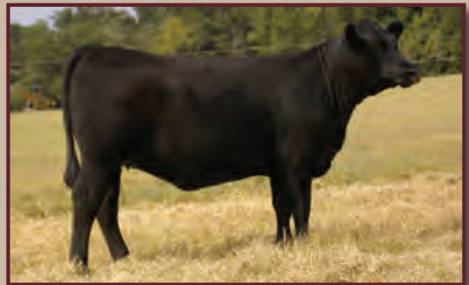
Lot 48B - Ms S Rock S Lucy 4876W5

Slicker haired In Focus female from the slick haired, sound structured, powerful S Lucy 4876 family. The In Focus females have added capacity and fleshing ability and are making good cows. The In Focus X 4876 should be a really good combination with added Milk and a balanced EPD profile from In Focus and the power, ideal structure and slicker hair of the 4876's.