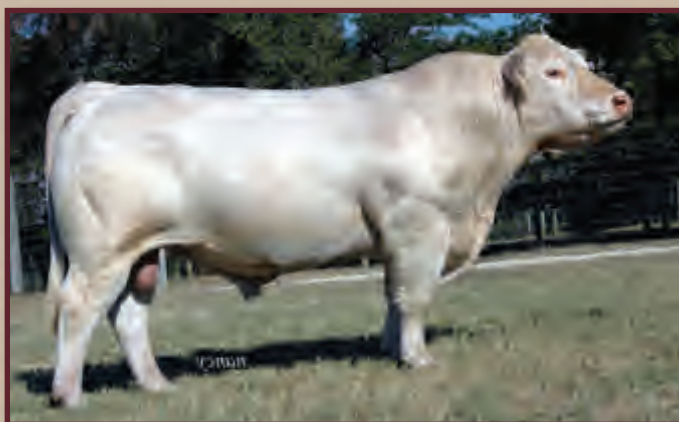
B/T Smart Choice M207