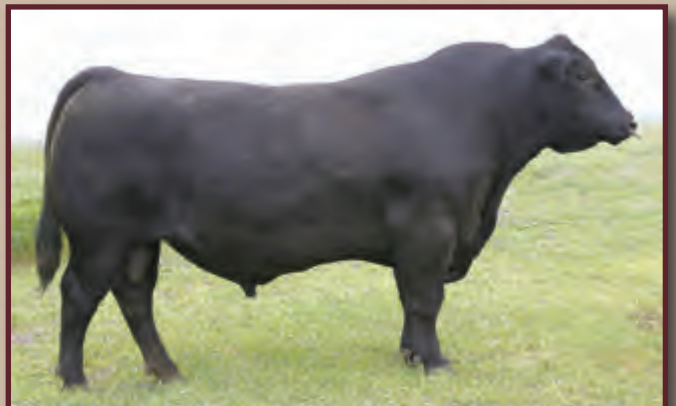
Reference Sire - Woodhill Mainline