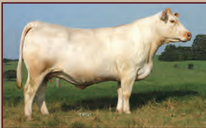
Hoodoo Ms George Z0116 - Dam of Lot 5 Donors