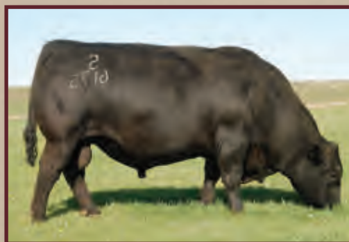
Reference Sire - S Chisum 6175

Beautiful Bennett Total daughter with a near perfect udder. She has the good hip and rib combined with the feminine neck and shoulders typical of the OCC Blackbird 846's. Her first calf ratioed 93 for BW and 113 for WW. Stout Chisum heifer calf at side.