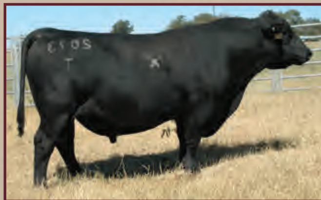
Reference Sire - Cooley Fnl Answer 2073T