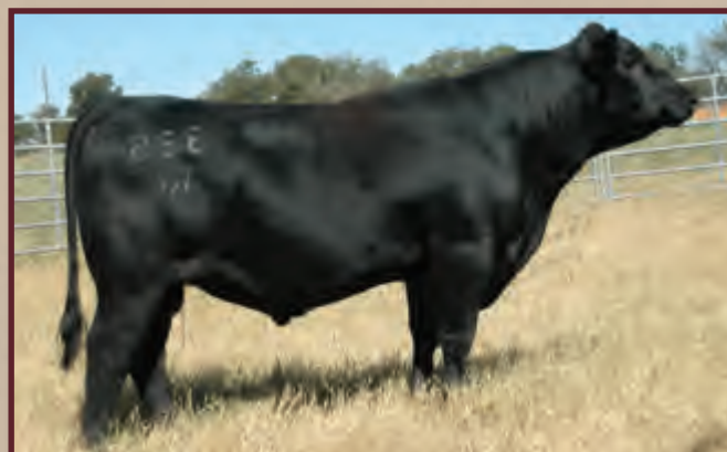
Reference Sire - S Rock McNelly 335W