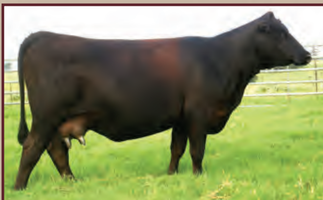
Lot 34 - Ms S Rock RR Blackbird 846T4