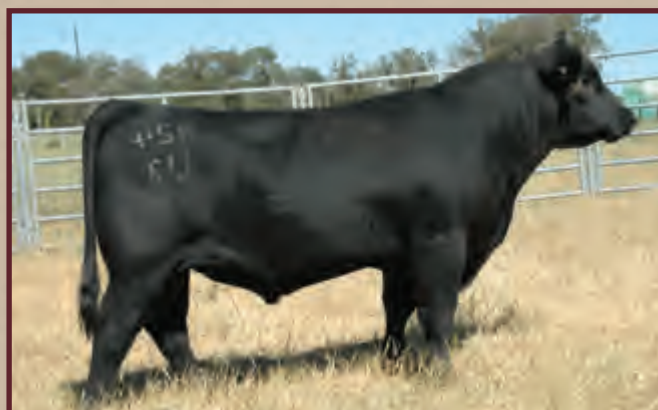
Reference Sire - S Rock Walker 824U3