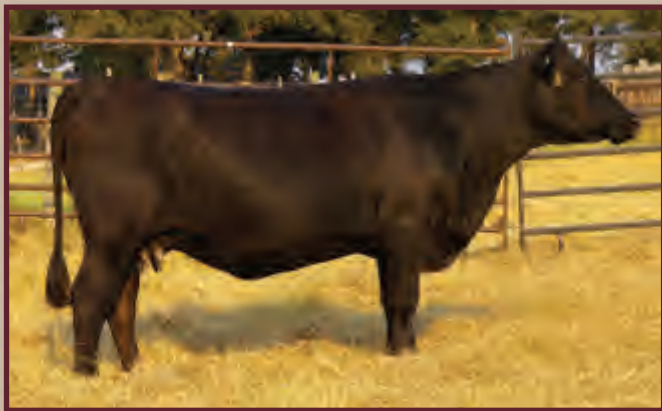
Lot 48 - Ms S Rock Dedication 4876T3

Maternal sister to the previous lot by Contrast. She exhibits the same positive functionality and attractiveness typical of the Sedgwicks Lucy's. Moderate birth weight with added growth and scrotal circumference. These 4876's are females to build a program around if you are concerned with soundness, ability to shed and added power.